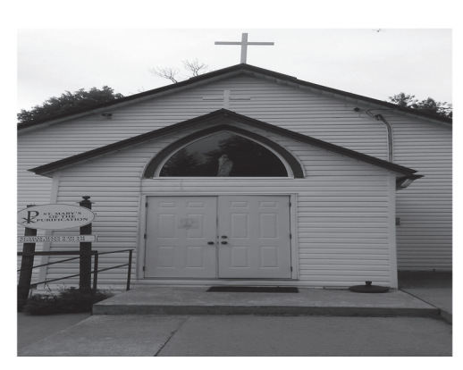
St. Mary's Mission Church 680 Clydesdale Rd. Apsley, ON K0L 1A0 Mass (Sunday) 9:00 am