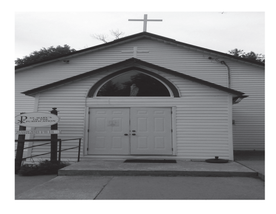
St. Mary's Mission Church 680 Clydesdale Rd. Apsley, ON K0L 1A0